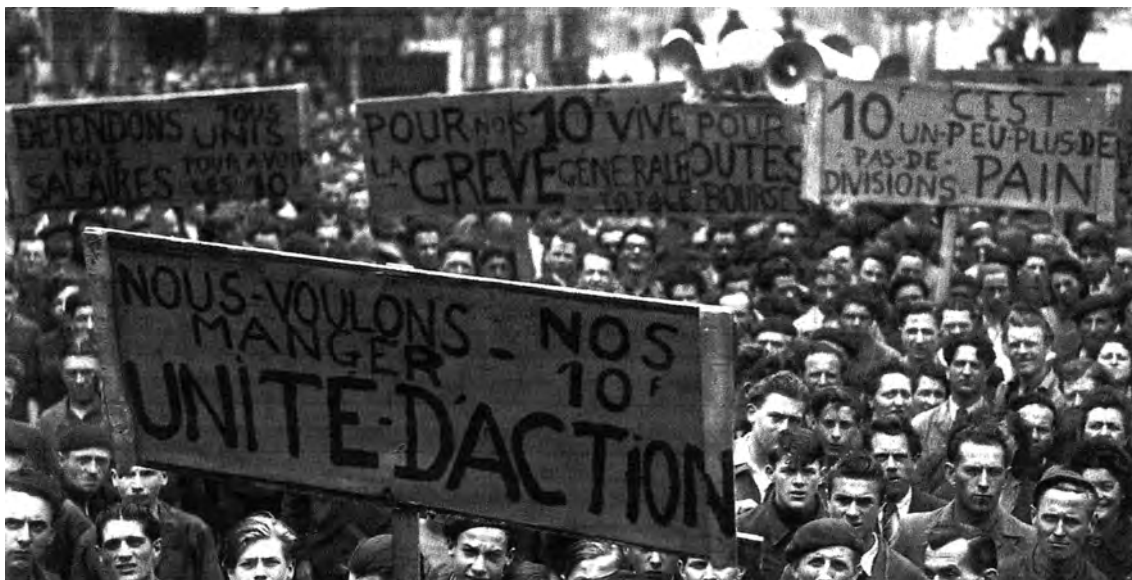
A photograph of workers in Paris demonstrating in 1947 for more pay, more bread and more united action by left-wing groups.