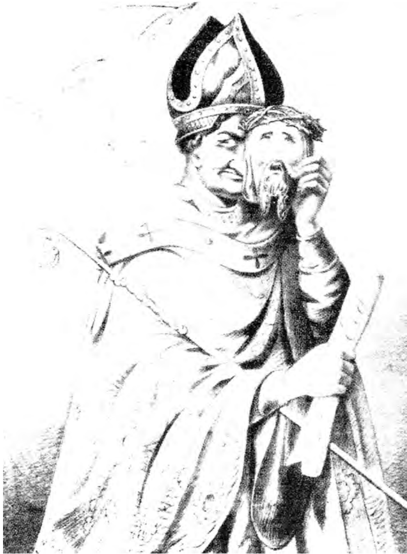
A cartoon of Pope Pius IX, published in Italy in 1852.

My army was almost alone in the struggle. The lack of provisions forced us to abandon the positions we had conquered. But the throbs of my heart were ever for Italian independence. People of the kingdom show yourselves strong in a first misfortune. Have confidence in your king. The cause of Italian independence is not yet lost.