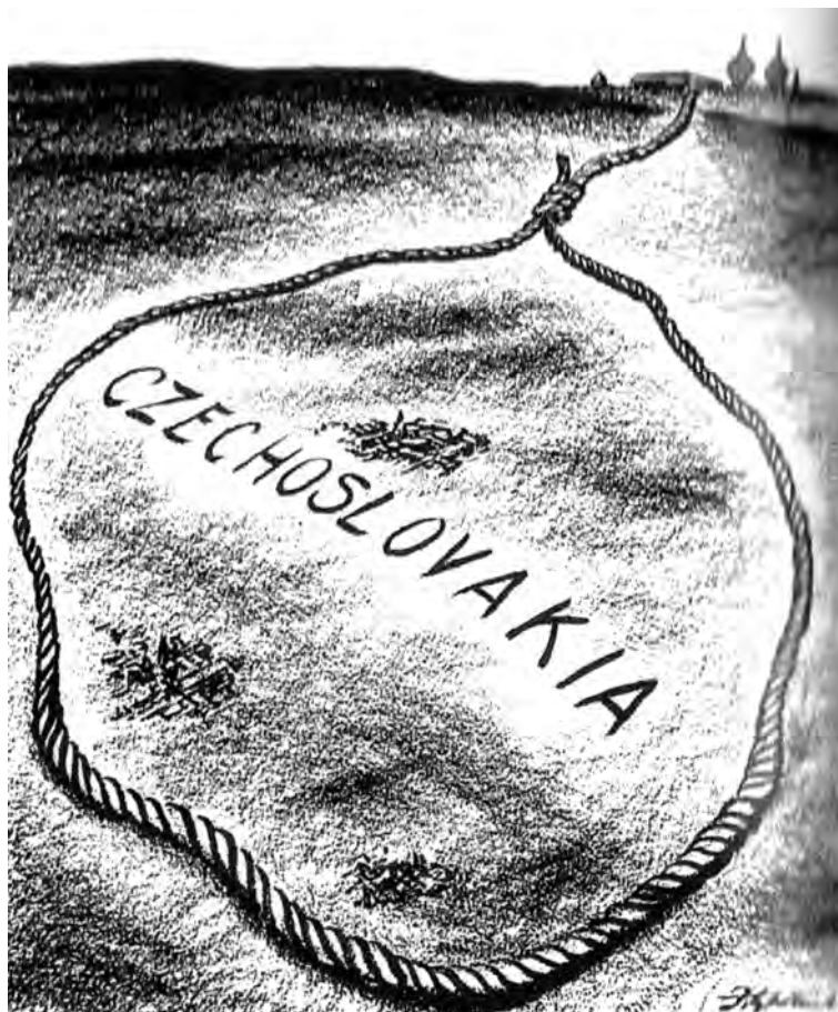
An American cartoon published in 1947. The title of the cartoon is 'When the time is right'.

From a statement by Molotov at the first Paris meeting about the Marshall Plan in July 1947. Molotov was the Soviet Foreign Minister.